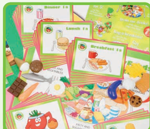
Resources, Lesson Plans & Whole School Activities