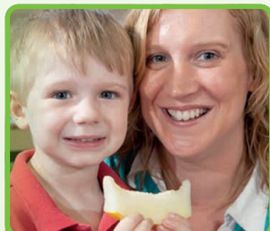
Support – National & Local