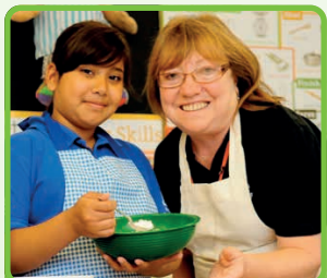
Training / Capacity Building

We provide early years settings and primary schools with;